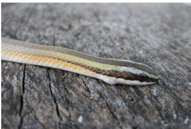
FIGURE 3. Detail of the head of L. paucidens (CZPLT-H-122).