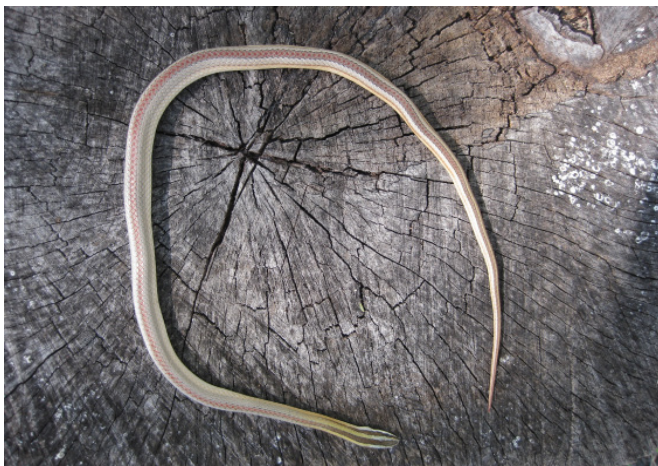
FIGURE 2. Specimen of Lygophis paucidens (CZPLT-H-122) found at Reserva Natural Laguna Blanca, in San Pedro Department, Paraguay.

EDITORIAL RESPONSIBILITY: Ross MacCulloch